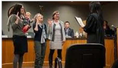
New City Councilors and Mayor